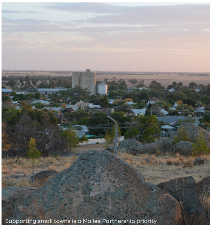
Supporting small towns is a Mallee Partnership priority

It has led to a focus on local issues and Government policies, and their impact, at the local place-based level.