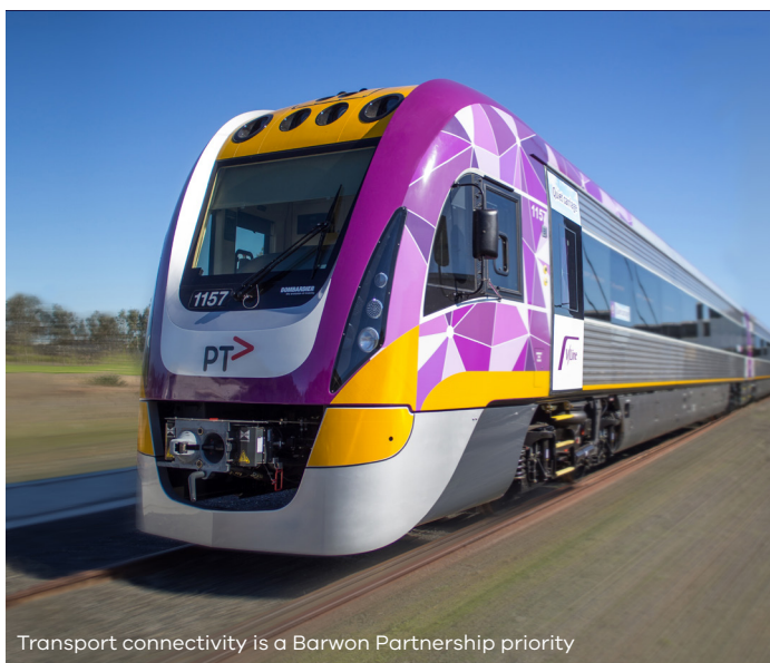
Transport connectivity is a Barwon Partnership priority

It has led to a focus on local issues and Government policies, and their impact, at the local place-based level.