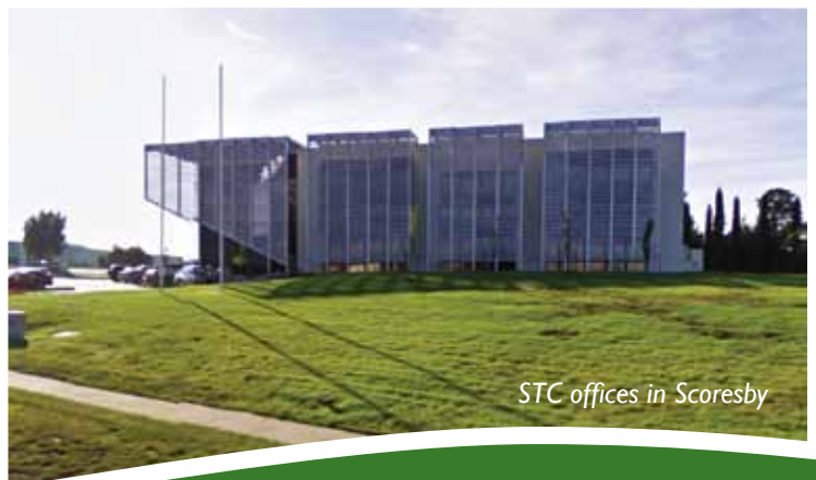
STC offices in Scoresby