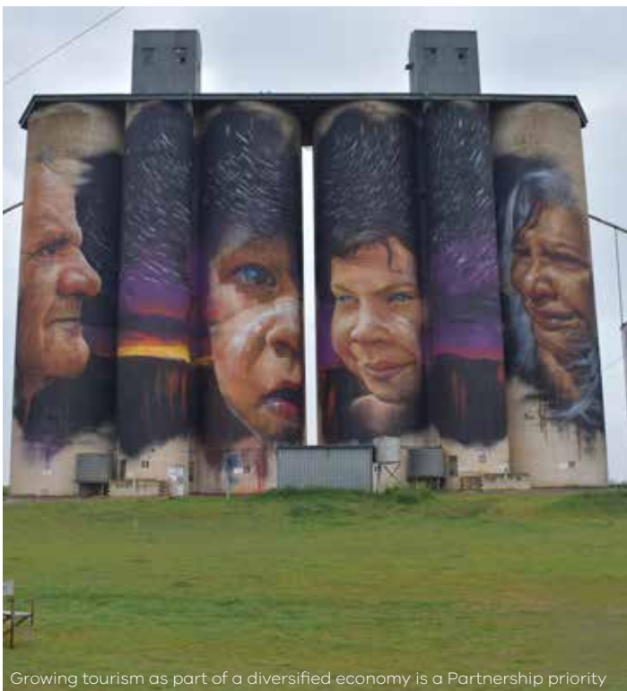
Growing tourism as part of a diversified economy is a Partnership priority

It has led to finding solutions to local issues, with support from Government, and together making an impact at the local place-based level.