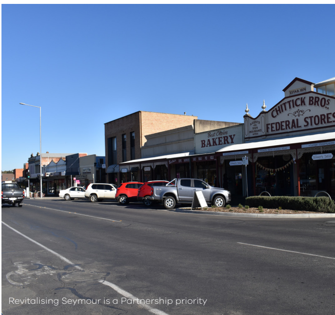
Revitalising Seymour is a Partnership priority

It has led to a focus on local issues as well as how Government policies impact at the local place-based level.