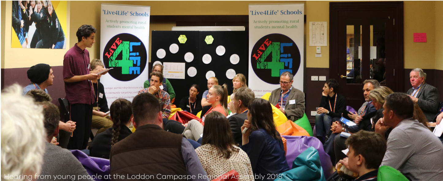
Hearing from young people at the Loddon Campaspe Regional Assembly 2018