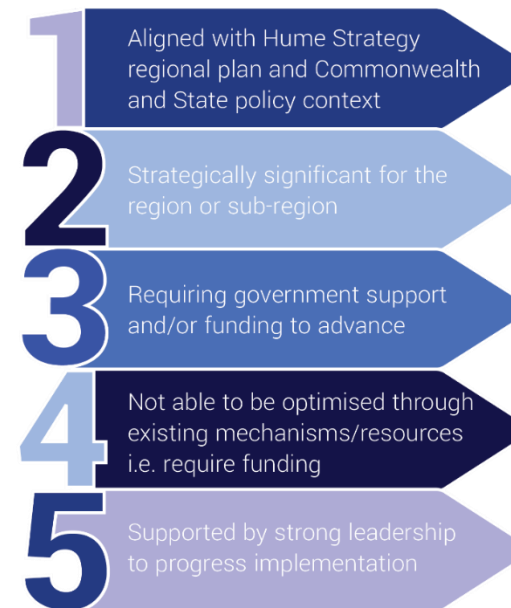
FIGURE 1 PRIORITY SETTING APPROACH