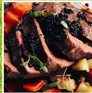
Caption to come