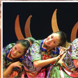
Caption to come