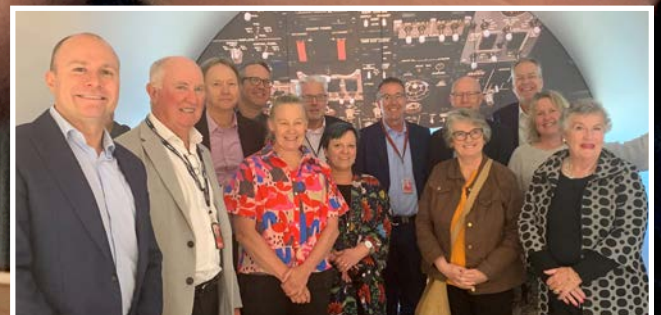
Avalon Airshow networking

Providing information, evidence, connections and opportunity