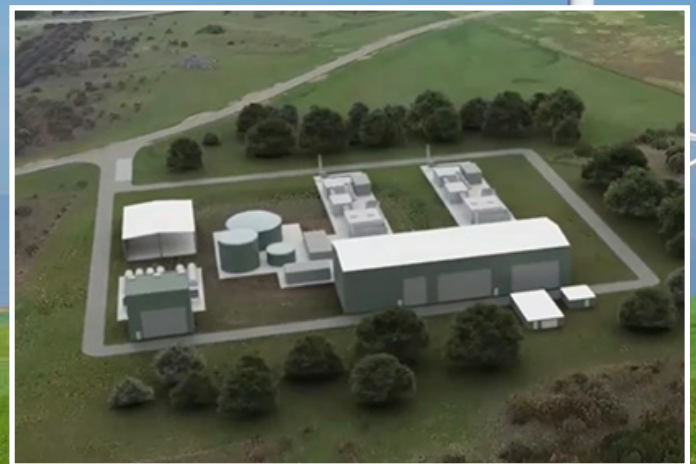
modigna temquidi con est il et voluptaqui ut erroror