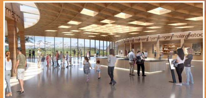
Twelve Apostles Visitor Experience Centre

Increasing sustainability and visitor yield