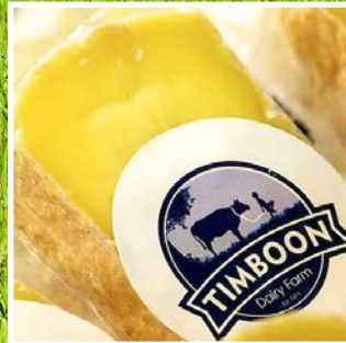
Caption to come