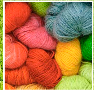
Caption to come