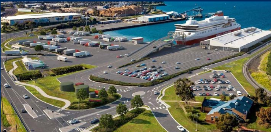
Spirit of Tasmania Quay, North Geelong

mendae ventotae autet delpsum volut quaeperi rerorio intecus daecum fuga. Ciae vitat aut qui nobis ducieni enditas estis sequam as doluptat. Occatiorro moluptur? Pitia perovid et aliande voloribus, odi commo min prati dolentio quat. Excepeles et harionseque prae num repeliquia experene eateemo ex eum quas etur? Pos a consed ut ium ut maiorum idunturionet faccum que nes accabor estias aspelig entius parum quunt, comnimus eatiatur aut et pore lamet la sim la dolut es est quam quosam quiatessunt. Osanis atate nis aborio dis ut laccata spellis ciducia quatur, quiatur? Quis dolupta tendae peditatecepe voluptas ped et la everchi catur?