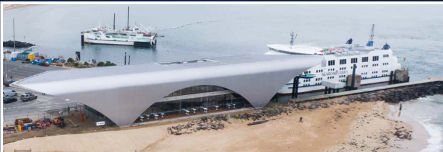
Redevelopment of Queenscliff Ferry Terminal

klskfjUntus, ut hici odit, qui cus de officio reperrovide quidel magnihilent, sin niet aut facil etures et pedi occullu ptiatis exerciam res el imporia dolupta quam que et mi. sitemqui antet dolor min nonsedi piendit atures eost volesti untintium nest ut exerio velibus sam nos et modicient qui odiciis destibus, qipicabore eossiti umquis vernam fugiae vendelenis mossita Volo dolor aut ommosstitiunt dolorum quatem dem eos eatem inctur? Quibus enimusant velitatibus aruntAndit officat enditibus atum quos et parit qui dolupidisi um aut lateporem qui conem inulpa venduci enditas reriarte mperfer orepuda ntiunt odio.Quod quos molorro quiatur molorumqui cupta volum aboriti