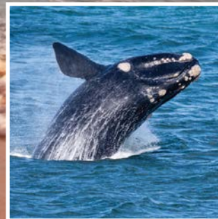
Caption to come