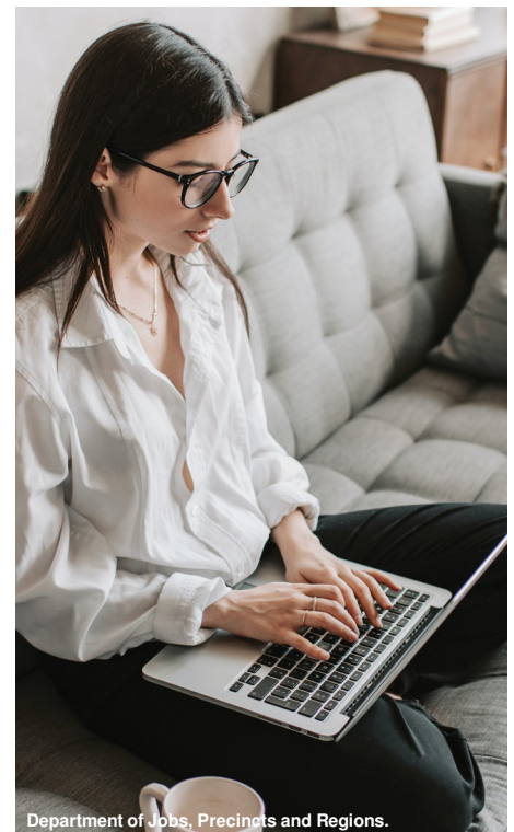
Department of Jobs, Precincts and Regions.

Ministerial support for the Victorian Government to fund a mobile and broadband monitoring system in the Central Highlands.