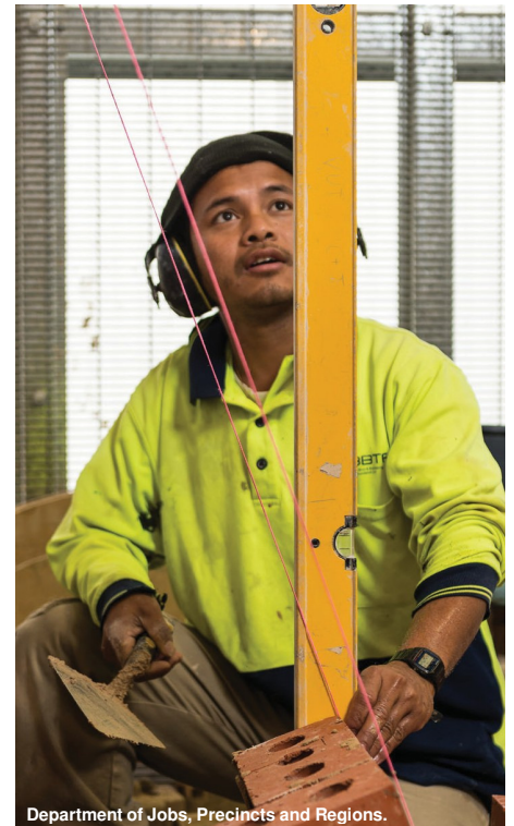
Department of Jobs, Precincts and Regions.

Ministerial support for the Victorian Government to fund these regional trials.