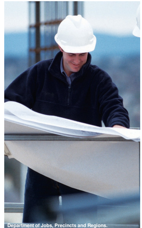
Department of Jobs, Precincts and Regions.

Ministerial support for the Victorian Government to create a State-wide Taskforce or Working Group to undertake planning scheme reform in Victoria. Ministerial support for DELWP to conduct a Central Highlands Planning Scheme Amendment